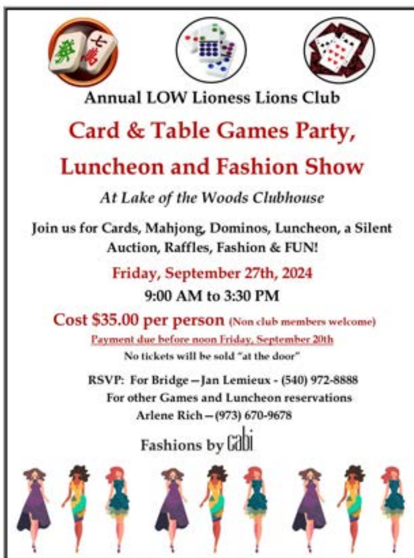
Table space fills quickly so act quickly to get in on all the fun!

Arlene Rich, 129 Monticello Circle, Locust Grove, VA 22508