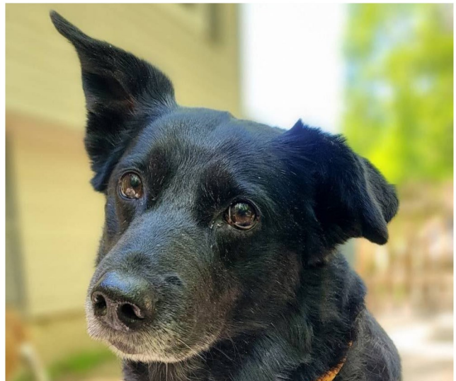
Sweet Grace (Unknown Breed)