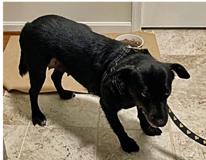
1st couple of days