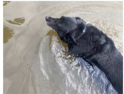
She loves to swim!