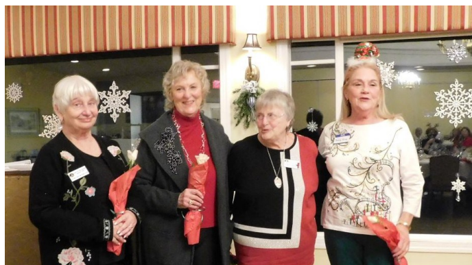
December Lioness birthdays!