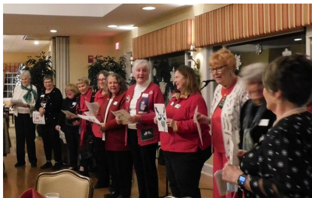
"The 12 Days of Christmas"