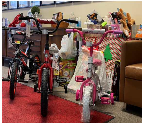
Licata Group collection box