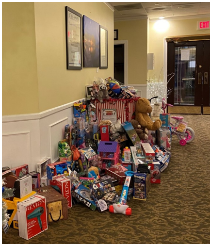
Clubhouse collection box

From the looks of the Toy Box collection stations, it appears to be a successful response.